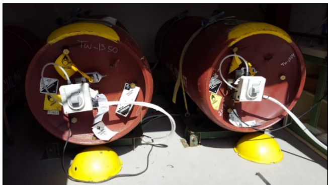
Ton cylinders of chlorine gas