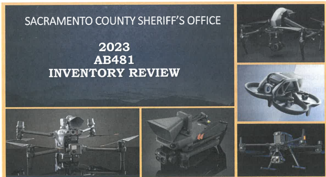
Presentation materials and newly requested AB 481 inventory shared at the May 16, 2023 meeting.

When the Board of Supervisors approved the Sheriff's Office AB481 Military Equipment Policy in October 2022, the Board provided direction for future items involving the Sheriff's Office use of military equipment to first be presented to the Community Review Commission. Government Code § 7072 requires the Sheriff's Office to release an annual report on its use of military equipment. Furthermore, within 30 days of submitting and publicly releasing the annual report, the Sheriff's Office policy requires the Sheriff's Office to hold at least one well-publicized and conveniently located community engagement meeting, at which the Sheriff's Office should discuss the report and respond to public questions regarding the funding, acquisition, or use of military equipment. The Community Review Commission meeting held on May 16, 2023 met these requirements and included extensive questions and answers regarding the Sheriff's Office Military Equipment Report.